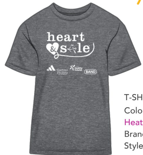
HEART & SOLE

T-SHIRT INFO Color: Graphite Heather Brand: Gildan Style #: 5000