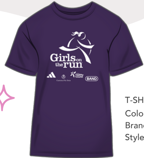
GIRLS ON THE RUN

T-SHIRT INFO Color: Purple Brand: Gildan Style #: 5000