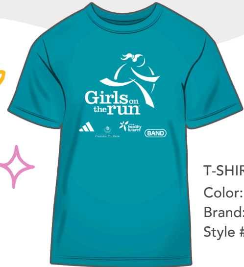
GIRLS ON THE RUN

T-SHIRT INFO Color: Tropical Blue Brand: Gildan Style #: 5000