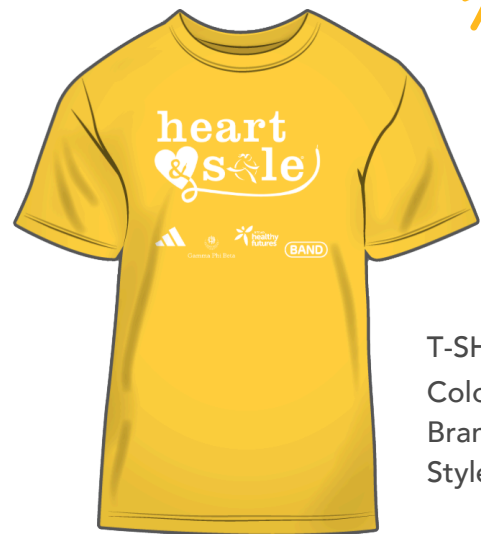
HEART & SOLE

T-SHIRT INFO Color: Daisy Brand: Gildan Style #: 5000